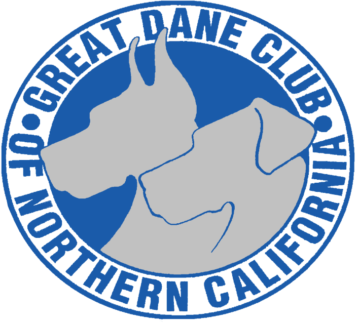
Licensed by the American Kennel Club

Event Numbers 2023153201, 2023153202, 2023153203, 2023153205