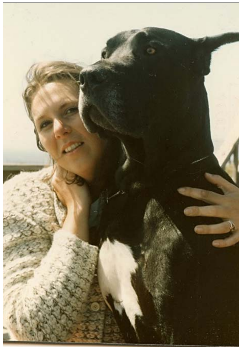
Pictured with Midnight