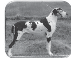
Merlin as a 5 year old

pictured in snow at over 11 years old and still going strong!